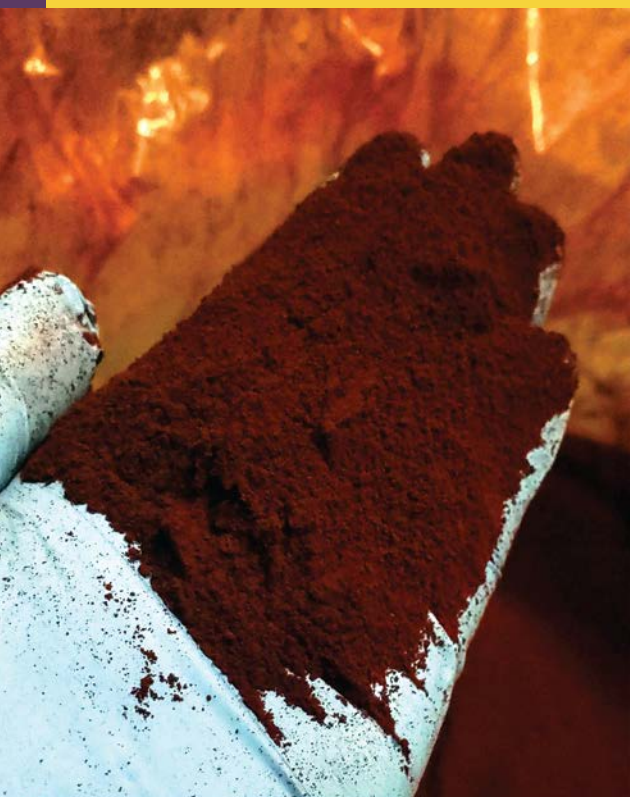
Spray-dried Astaxanthin powder

Dry powders with high concentration of non-polar compounds and healthy fats. Patents and Patents-pending. In-house micro-encapsulation.